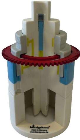
Illustration 2: Königsdorn® in assembled condition

The workpiece is positioned outside the machine on the Königsdorn® and then pinned in position by means of the intermediate bushing. The actuating screw is screwed in by the operator using a hexagonal wrench. Here, two offset clamping points expand in the \mu\text{m} range and uniformly expand the clamping collet - the component is centered with high precision. For high, consistent measurement quality, this application guarantees a repeatability of less than or equal to 0.008 mm.