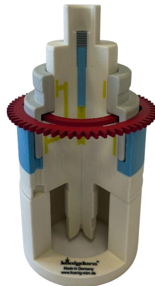
Illustration 1: Clamping mandrel for measuring the external tooting

For example, a highly accurate hydraulic Königsdorn® for measuring an external gear is just one of many examples of how König-mtm develops and manufactures specific clamping solutions for customer applications. This clamping device is held between centers in the measuring machine. The external teeth of the component is inspected in the \mu\text{m} range. The challenge in this clamping example was the very thin-walled workpiece, which could not be clamped on the centric inner diameter due to its geometry. In cooperation with the customer, König-mtm developed a clamping solution in which clamping is carried out in the centrally offset intermediate spaces by means of an interrupted, accurately fitting, clamping collet.